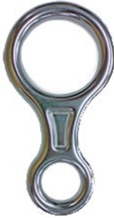
FIGURE OF EIGHT IN ALUMINIUM REF:TC004